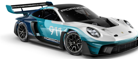
Speed Icon Design